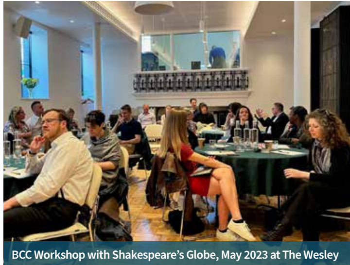
BCC Workshop with Shakespeare's Globe, May 2023 at The Wesley