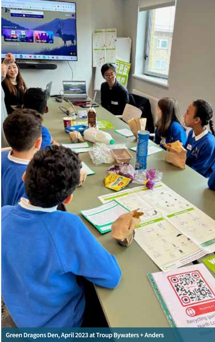
Green Dragons Den, April 2023 at Troup Bywaters + Anders