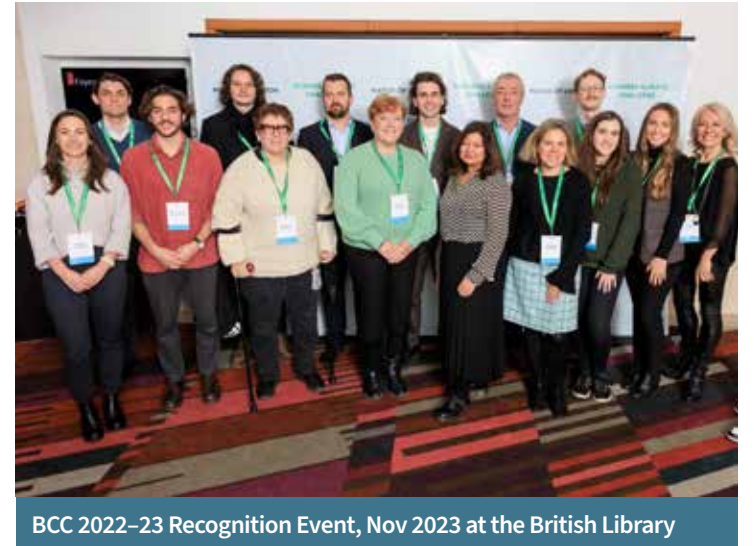
BCC 2022-23 Recognition Event, Nov 2023 at the British Library