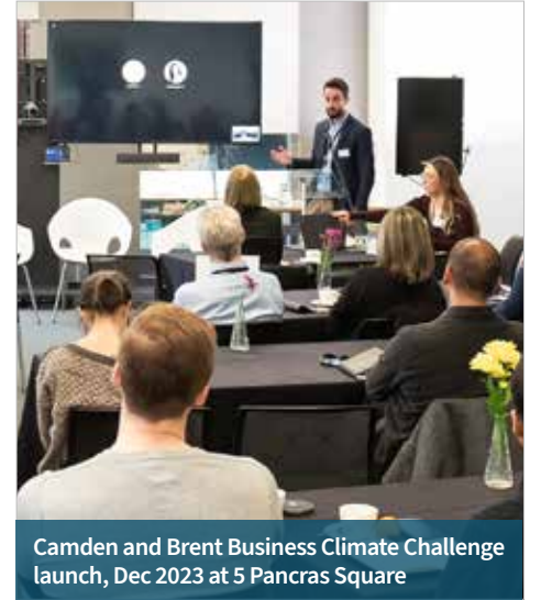
Camden and Brent Business Climate Challenge launch, Dec 2023 at 5 Pancras Square