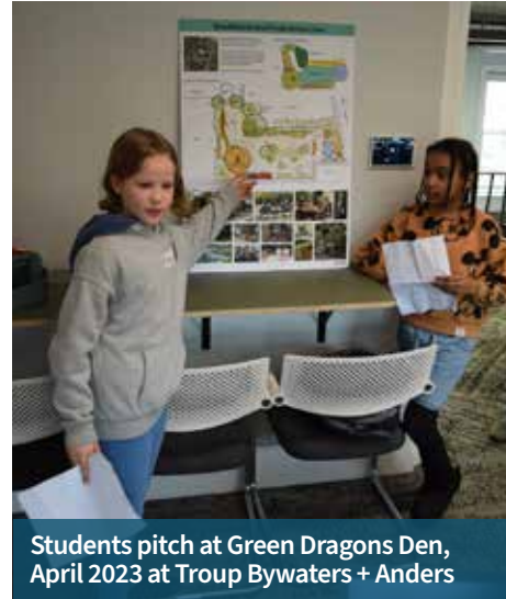
Students pitch at Green Dragons Den, April 2023 at Troup Bywaters + Anders